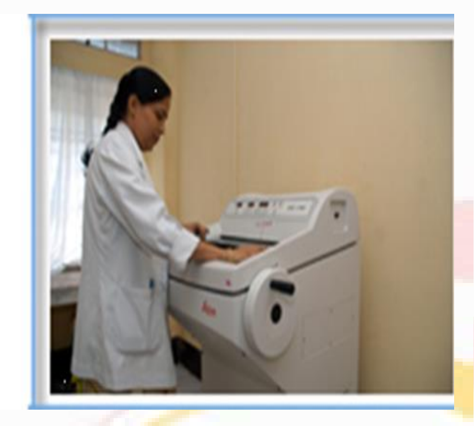
Frozen Section Machine