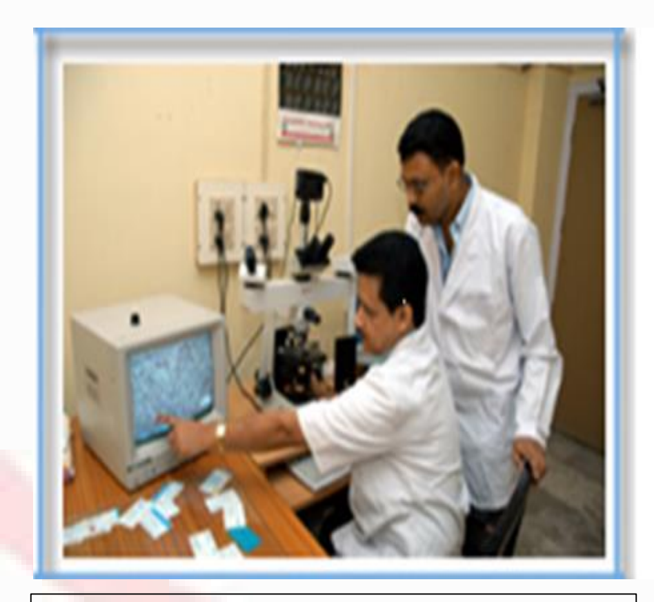
Digital Video Microscopy